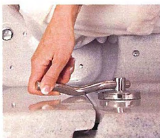
Life-time warranty on door seal