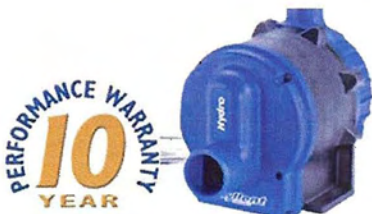
New Syllent Pump, no seals to leak.